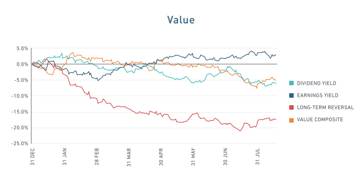
EXHIBIT 3: Performance Varies by Factor in 2015 (YD)

Regional Momentum, on the other hand, has been performing poorly for most of 2015 to date (top right panel). U.S. companies with exposures to China have been suffering from the recent drawdown in Chinese markets (bottom panel).