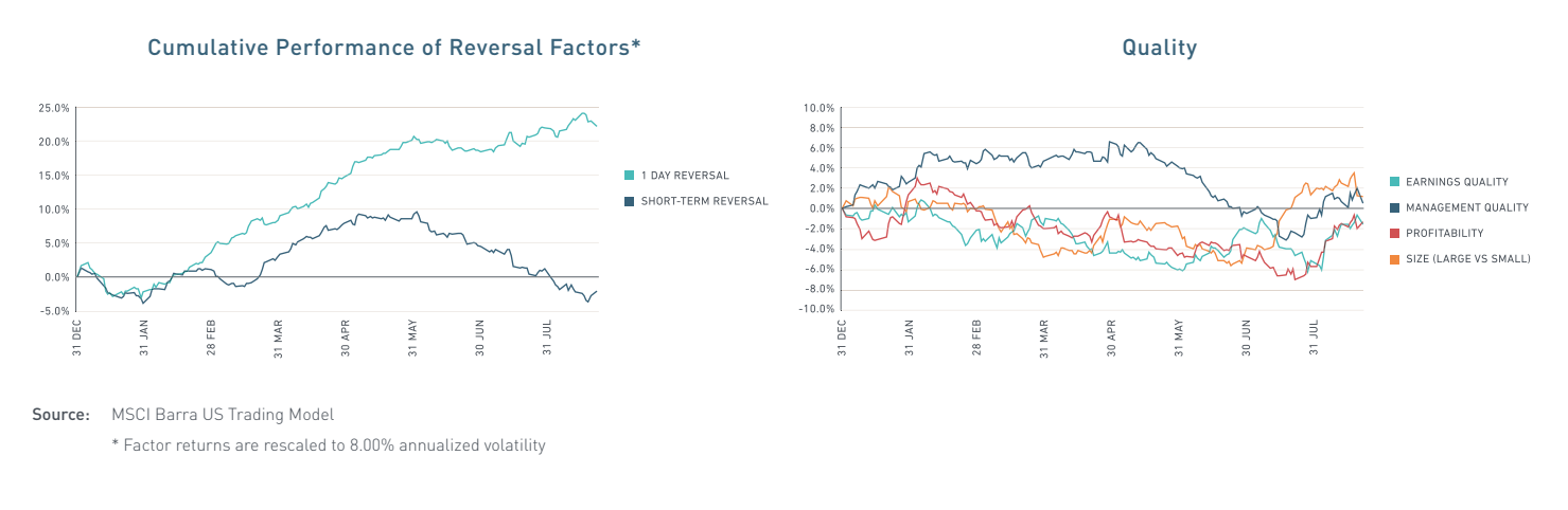
EXHIBIT 1: Investors Head for Quality, But Not Yet to Cash